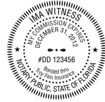
Round Stamp Image - not actual size.

This round self-inking stamp produces clear impressions similar in format to a metal embosser. No need for a separate ink pad.