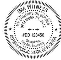
Round Stamp Image - not actual size.

This round self-inking stamp produces clear impressions similar in format to a metal embosser. No need for a separate ink pad.